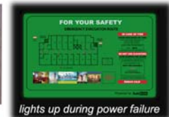
lights up during power failure

Provide Egress Instructions during a power failure.