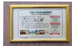
Under Normal lighting